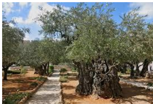
Garden of Gethsemane