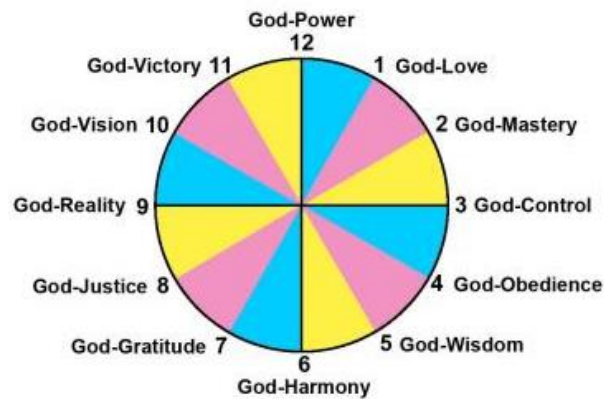
Figure 11 The God Consciousness, or God-Qualities, of Lines of the Clock

TWELVE O’CLOCK LINE [Capricorn] - Andrew , the brother of Simon Peter and the first disciple called to this mission and he responded. Andrew was present when Jesus was baptized, and receive the etheric blueprint of his mission.