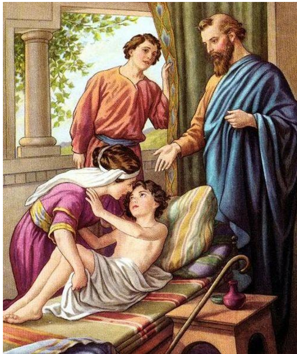
Elisha restoring to life the son of the woman of Shunem (2 Kings 4:18–37)

"These gifts of the Spirit shall then be yours to project as hope to those standing in the shadow of doubt, as healing to those who, lacking wholeness, need a physician, and as the Great Light that shall be seen by all who walk in darkness. Your life will then become a mission on behalf of the Holy Spirit; following in the footsteps of the avatars and elder brothers of the race, you will, by his authority and grace, prepare the way for the great golden age to come into the consciousness of men even as they are transformed and renewed by the Christ mind...."