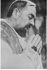
Saint Pio of Pietrelcina (1887 – 1968)