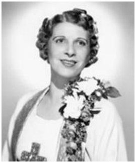
Sister Aimee Semple McPherson (1890–1944)

Thou wondrous mighty I AM Presence, Almighty God, in the name of Saint Germain, I ever grow in deeper praise, thanks and gratitude to Thee for Thy Life, Light, Love and Intelligent Power manifest everywhere in the Universe! And I invoke the fullness of Thy Majestic Presence, in action now: And I say unto thee, O God, let the power, wisdom and love of your cosmic inspiration flow across this nation, America, in ever-widening waves, extending itself to all nations of the earth and inviting them, by cosmic invitation, to drink of this fount of freedom and liberty, bearing well in mind that men have given not only lives and fortunes and sacred honor for it, but they have also given the allness of themselves.