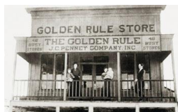
J.C. Penny (1875 – 1971)

Mark Prophet in one of his recorded lectures announced Mr. Penny made his ascension, in part due to his strong standards of ethic—and honesty—which he passed on as foundation principles for his retail stores. He was raised in the Christian ethic with an abiding faith in God, very interested in the deeper spiritual values of life. He climbed his way from humble beginnings to the top of the international retail market by an abiding practice of the name of his first store, called the Golden Rule. He made his transition in 1971 at the age 95.