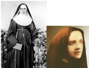
Saint Frances Xavier Cabrini (1850–1917)